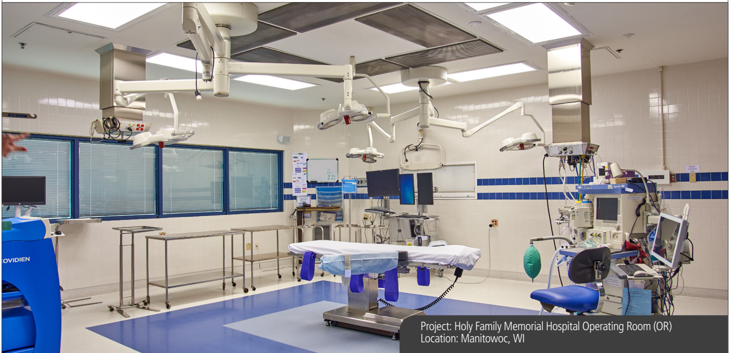
Project: Holy Family Memorial Hospital Operating Room (OR) Location: Manitowoc, WI

“We chose to partner with Indigo-Clean over other disinfecting technologies because of the ease of use and the proven efficacy of the disinfecting lights. We look forward to expanding our usage of Indigo-Clean in other areas of the hospital in the future.”