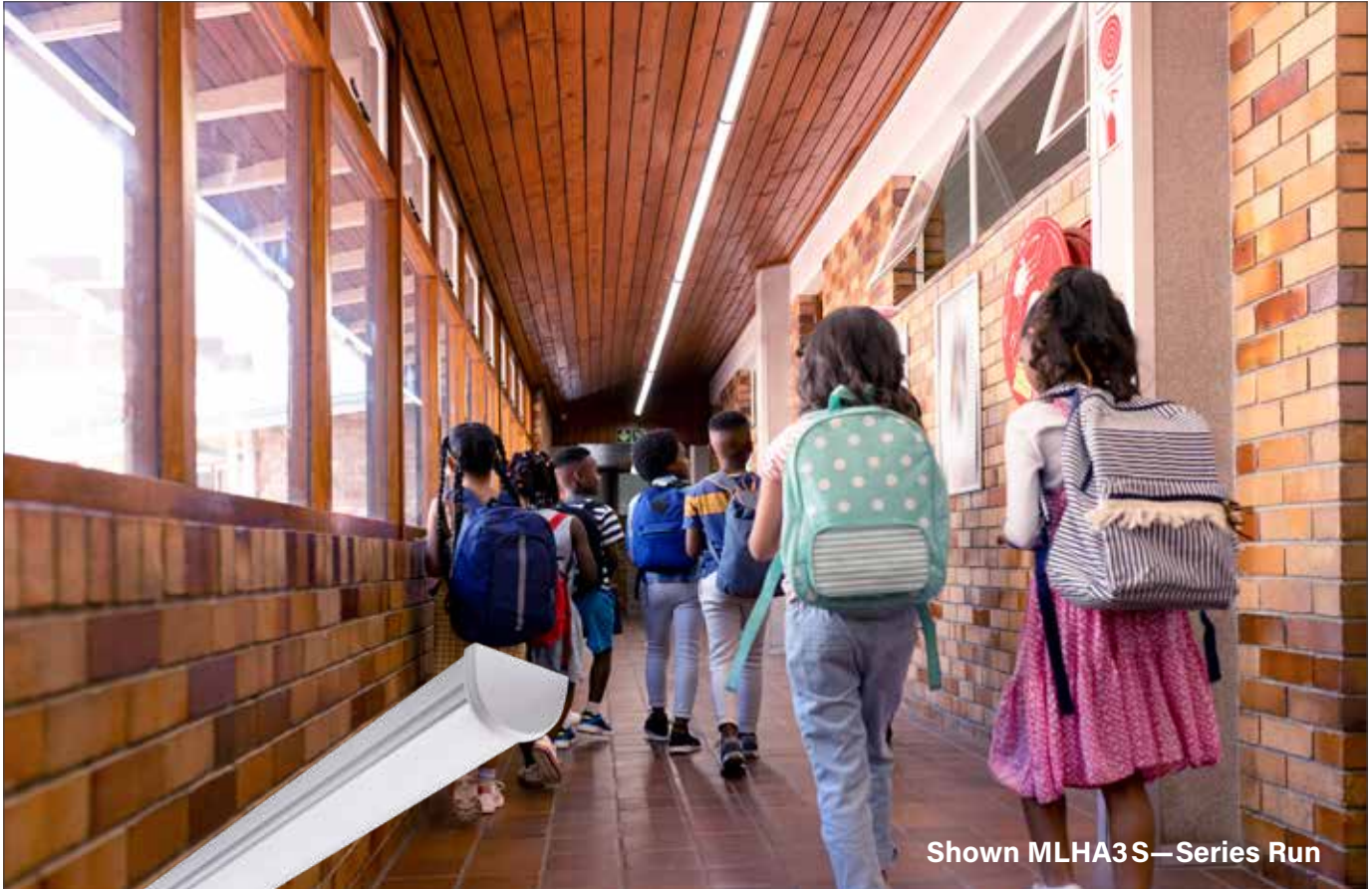
Shown MLHA3S—Series Run