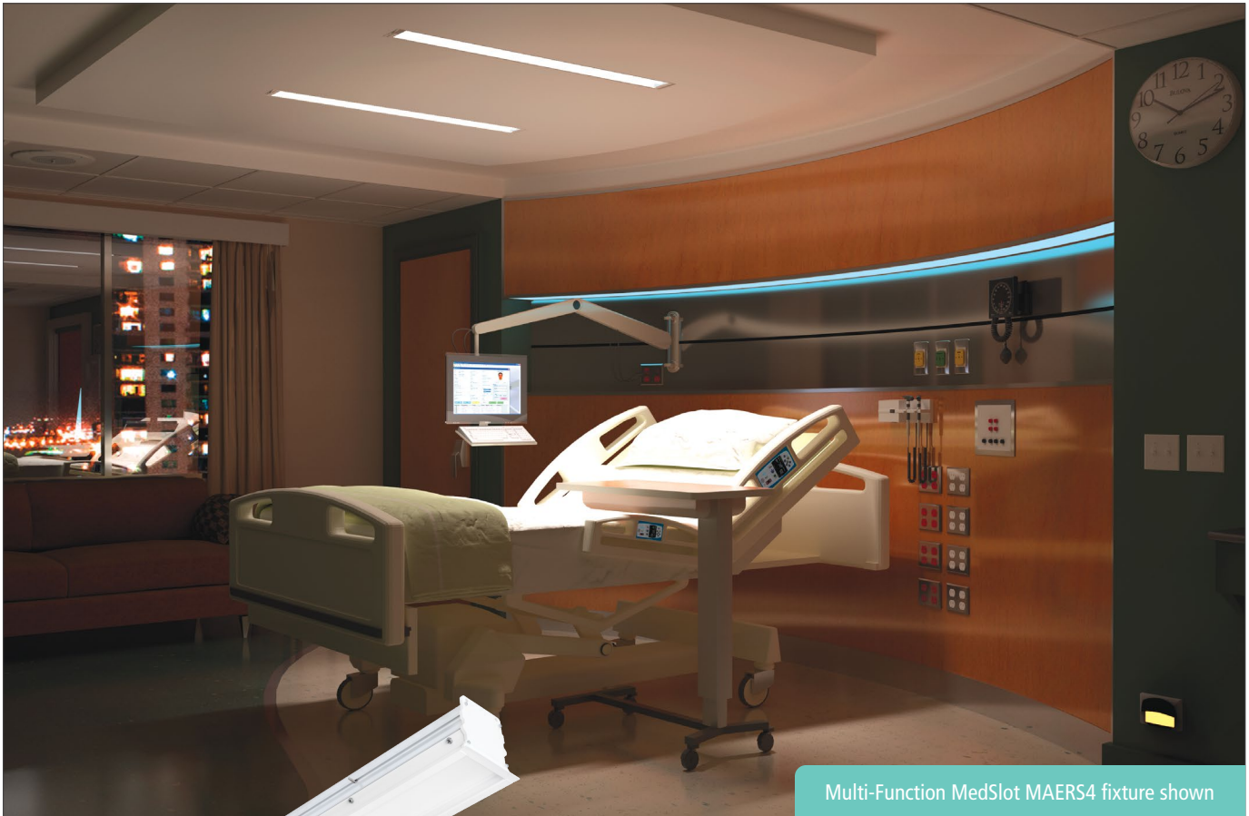
Multi-Function MedSlot MAERS4 fixture shown

Combining a Sleek Design Aesthetic with Unparalleled Performance