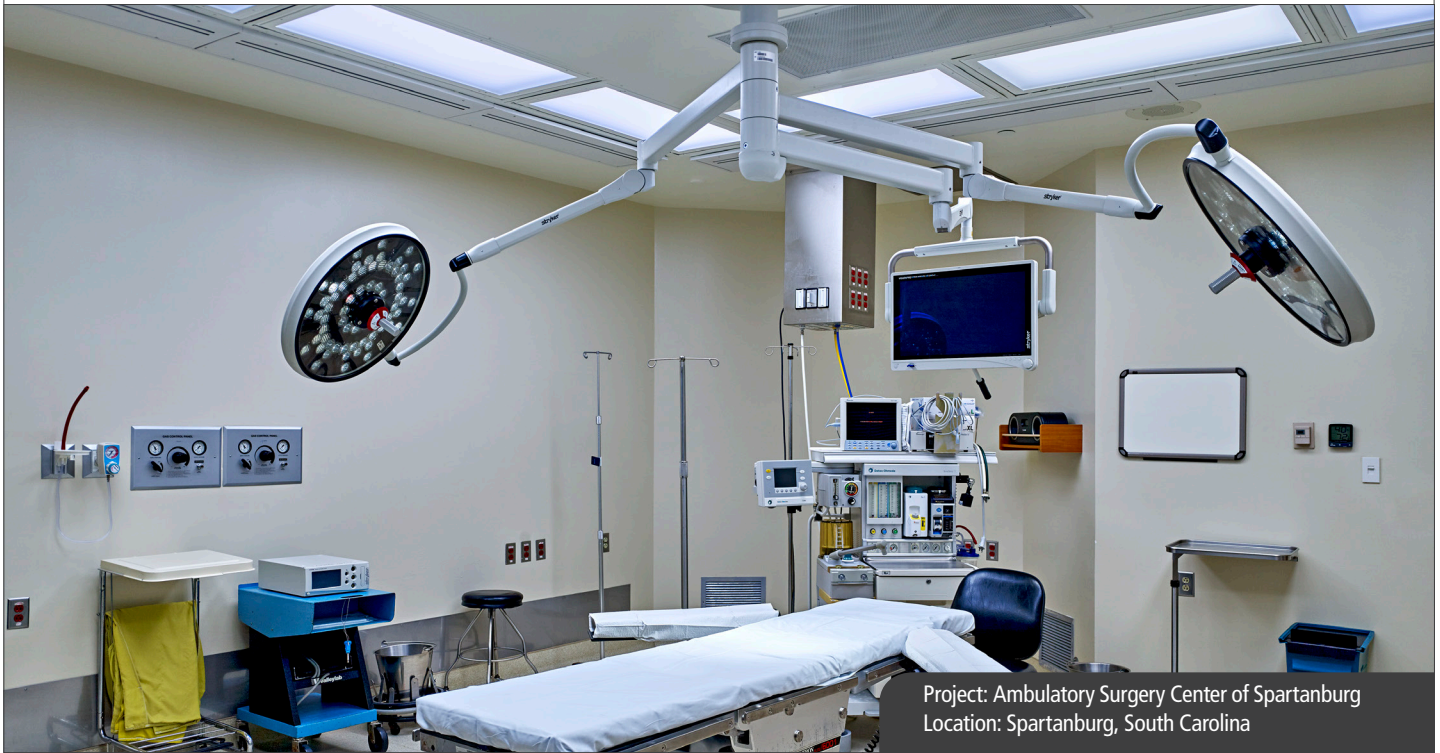
Project: Ambulatory Surgery Center of Spartanburg Location: Spartanburg, South Carolina

“We wanted a disinfectant technology that would be effective, efficient and easy to use which is exactly what Indigo-Clean is. Compared to other disinfecting technology on the market, Indigo-Clean was the most cost effective and efficient since there was no room downtime, and because it’s automatic, it alleviates the concern of training and human error.”