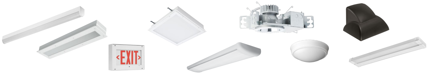
Left to right: EnviroSeal™ ES3; MightyMac™ RMCA/RMCD; MMEX Exit Signs; SimpleSeal™ CSEDI; Millenium™ Stretch MLHA, Downlight HADL, Round MR17, Finite FN9 and FN15; and Stratalume™

Fulton State Hospital (FSH) has been a fixture in mid-Missouri since 1851, but in 2014, the oldest psychiatric hospital west of the Mississippi was in desperate need of replacement. Home to high and low security psychiatric patients, developmentally disabled clients and a Sexual Offender Rehabilitation and Treatment Service program (SORTS), FSH operated in 1930s era buildings, with some equipment leftover from the Korean War.