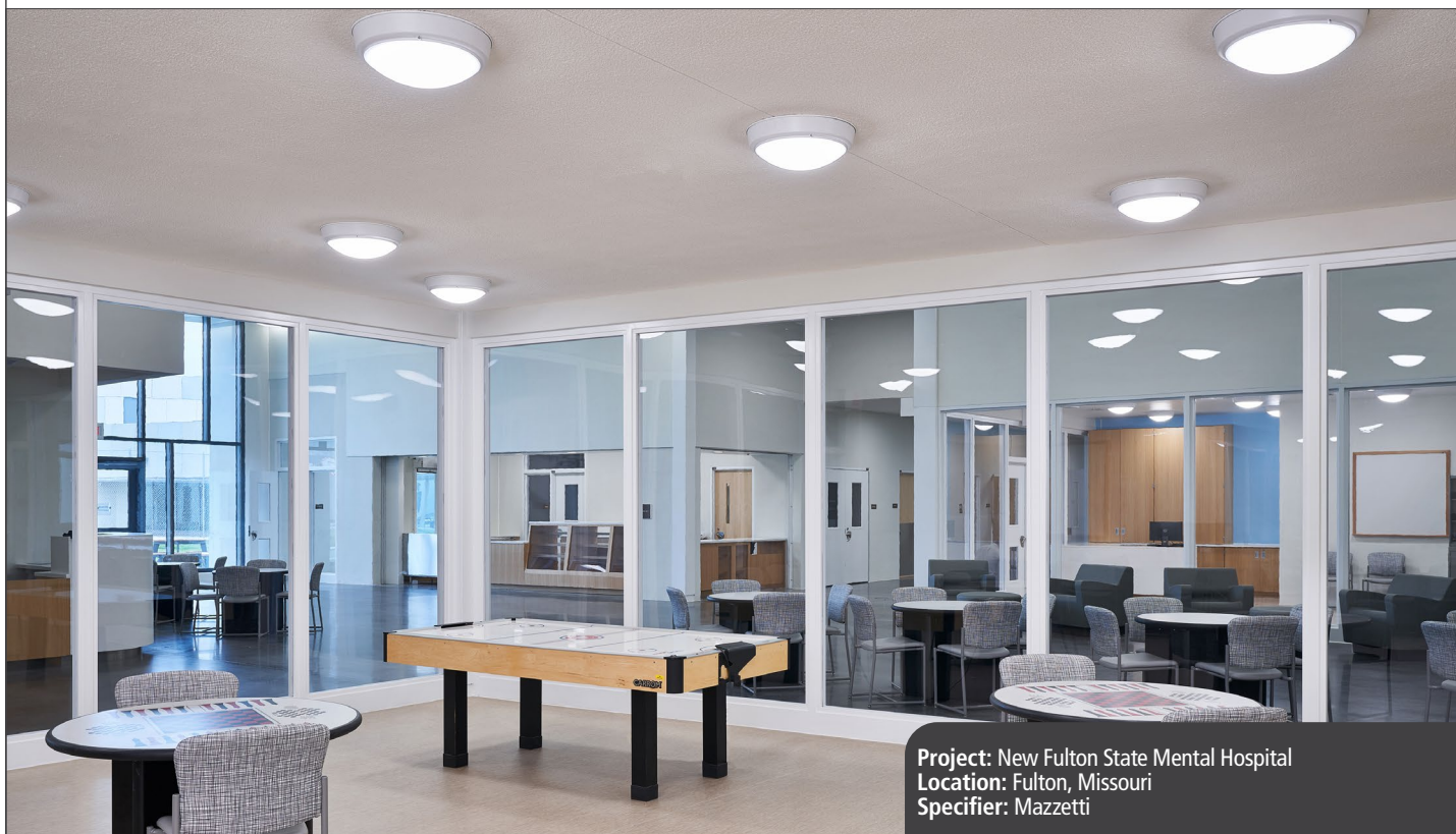
Project: New Fulton State Mental Hospital Location: Fulton, Missouri Specifier: Mazzetti

“Kenall is one of the few manufacturers that offers architecturally sensitive products that are also physically robust enough to be considered for these environments.”