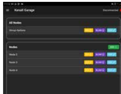
2) Connect to fixture