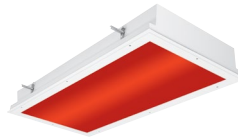
SimpleSeal CSEDI with 630nm red