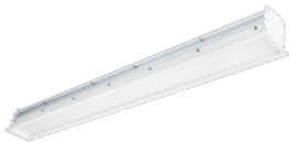
SimpleSeal™ CleanSlot™ CRS4