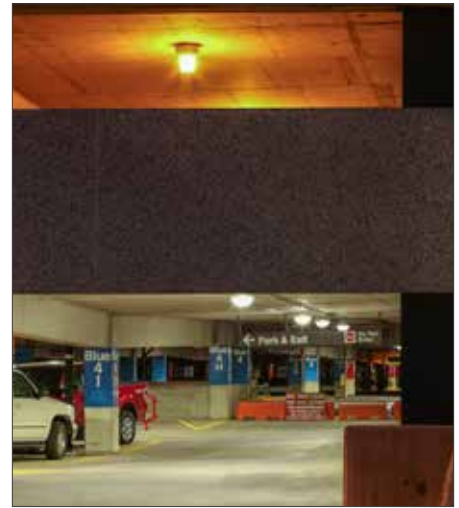
This photo demonstrates the contrast between the incumbent high-pressure sodium lighting (top deck above) and the new LED TD17 luminaires (below).