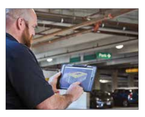
Above: Cloud-based TekLink™TL1000 controls helps VCU boost energy savings and track usage.

VCU's energy cost savings was significant right from the beginning. In the first six months, savings increased steadily from 44.4% in August 2015 (the first month the luminaires were in use), to 55% in January 2016 after the TekLink control system had been fully operational for two months.